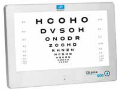
CS POLA 600