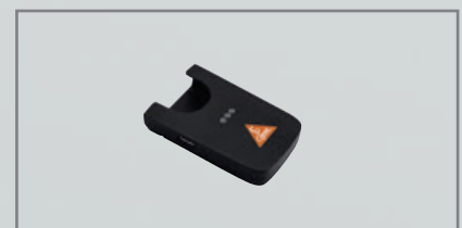
CC1 charging case [02]