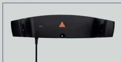
CW1 wall charger [05]