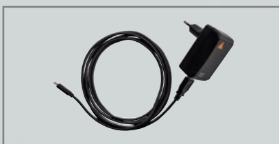
E4-USBC power supply with cable [04]