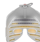
Reduces swelling & increases drainage