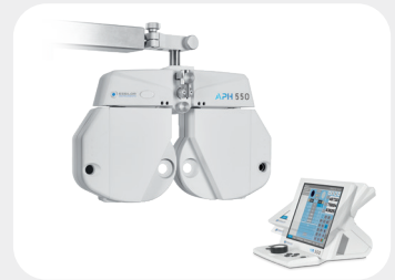
Direct control from APH 550 automatic phoropter console